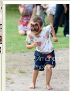
Future Musicians enjoying the music (AM)