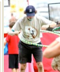
Volunteer Hooping Time (AM)