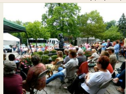
Large crowd watching the Lost Cuzzins at the Irish Rose Stage