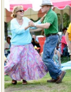
Swing Dancing (AM)