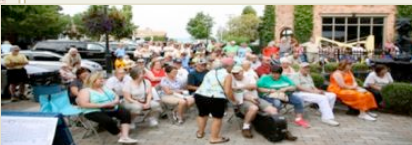
More of the audience at Irish Rose Stage