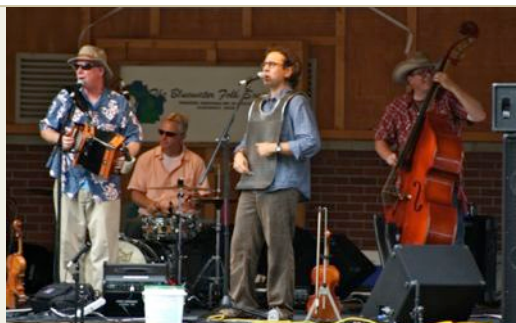
Creole du Nord performing their magic this year AM photo