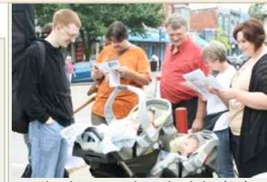
Checking out the schedule. (SB)