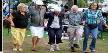
Happy Dancing (AM)