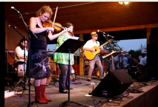
Red Sea Pedsiatrians wowing the crowd at the Lexington DDA Stage (AM)