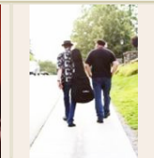
Time to go!