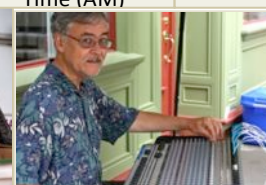
Volunteer Musician running sound at the Irish Rose Stage (AM)