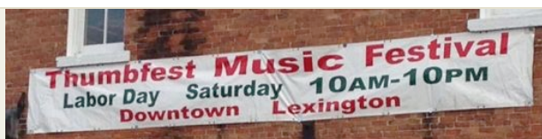
Sign on side of Old Town Hall Winery

Our future exists in the youth we see participating as musicians, volunteers & audience at the Thumbfest AND the supporting businesses, audience and musicians that spread the word about Thumbfest & the BWFS! Look at all the HAPPY Faces in the pictures. Come Join Us!