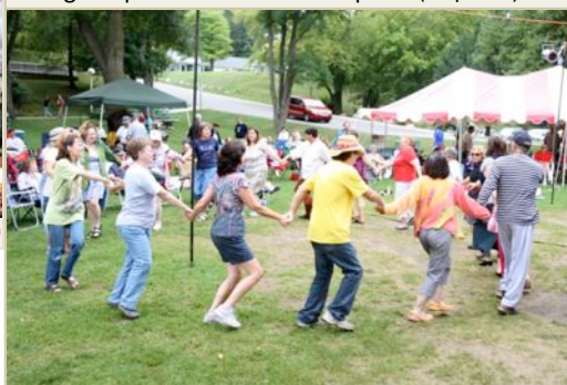
Audience dancing away with LeCompagnie (AM)