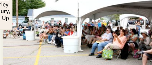
Happy overflowing audience at the McNabb Stage, overflowing the entire day. (AM)