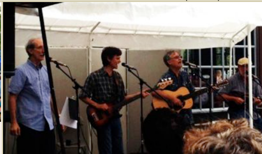
Lost Cuzzins at the Irish Rose Stage . Hard to get a good picture with the tent poles